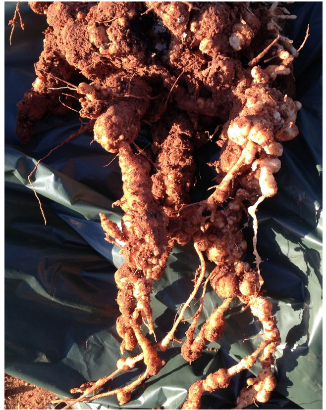
RKN infested tomato roots, Carnarvon WA.